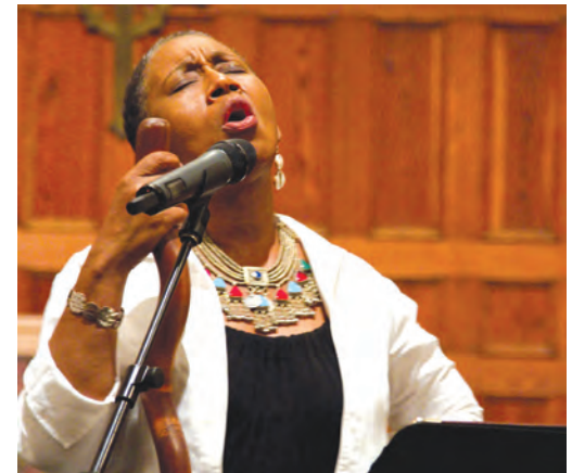
THE SOUND OF CHARLESTON Saturday, Jun 3 at 2 p.m. Saturday, Jun 10 at 2 p.m. at Circular Congregational Church