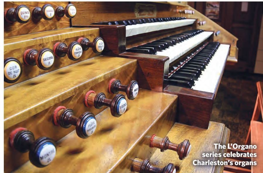
The L'Organo series celebrates Charleston's organs

This annual patriotic tradition features the combined Charleston Concert Band and Columbia Community Band in a concert ranging from rousing marches to Broadway show tunes. It concludes with