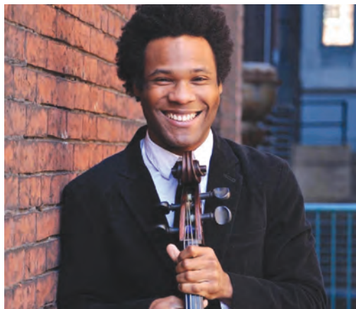
EARLY MUSIC SERIES BACH CELLO SUITES Wednesday, June 7 at 3 p.m. at St. Mary's Catholic Church