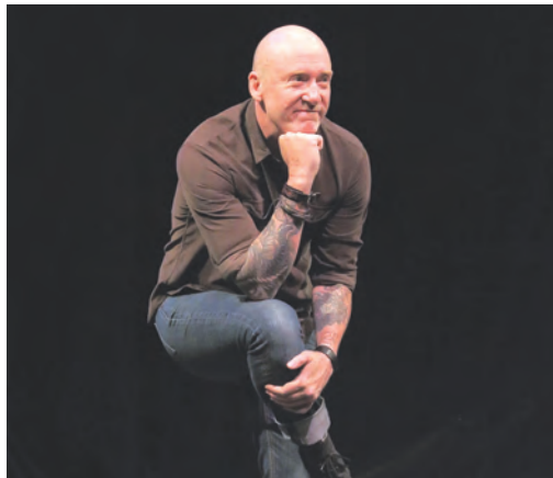
BOOGER RED Friday, June 2 at 7 p.m. Saturday, June 3 at 6 p.m. Sunday, June 4 at 7 p.m. Threshold Repertory Theatre