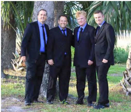
LOVE IS IN THE AIR WITH THE CHARLESTONES Friday, June 2 at 7 p.m. at Cannon Street Arts Center