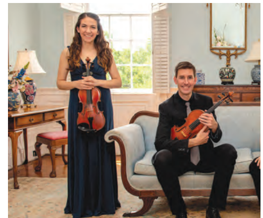
CAPTURING THE AMERICAN SPIRIT: MUSIC OF DVORAK, PRICE, BURLEIGH, AND STILL Wednesday, June 7 at 6 p.m. at South Carolina Society Hall

HOSTING AN EVENT? For more information on using City Paper Tickets for your next event contact us at sales@charlestoncitypaper.com